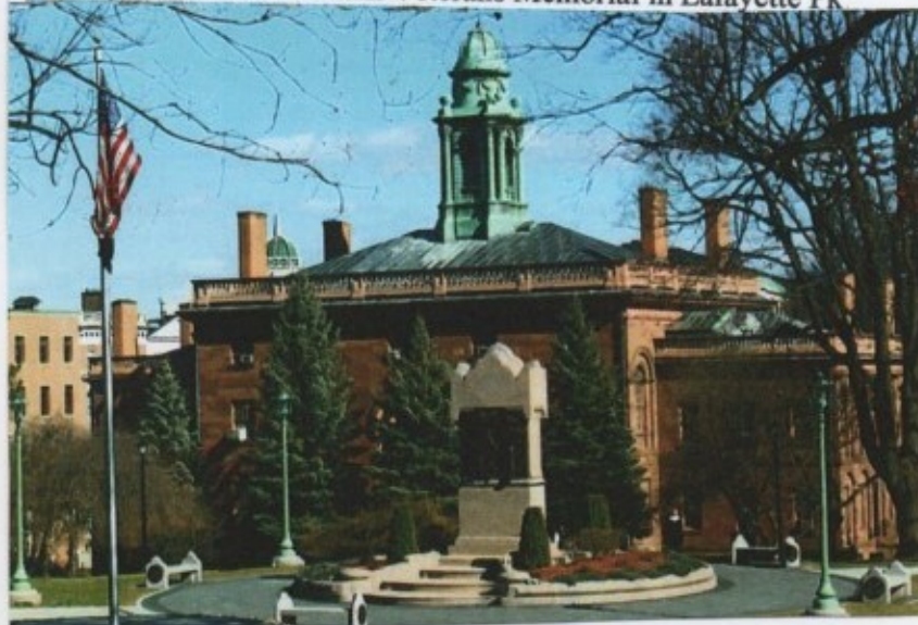
Albany New York Vietnam Veterans Memorial in Lafayette Pk

***** The Four Chaplains Ceremony, normally held in February at First Reformed Church of Schenectady; where 1 of the 4 Chaplains was a minister at this church (Rev. Clark V. Poling). This event is hosted by the Jewish War Veterans Post 105. As of now, the honoree and event information in not definite. Note: On 2/3/1943, the USAT Dorchester was sunk by a German submarine U-223 off Newfoundland.