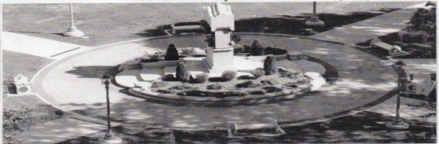
Let us say a prayer for their safe return; thank them and ALL those serving our Country.