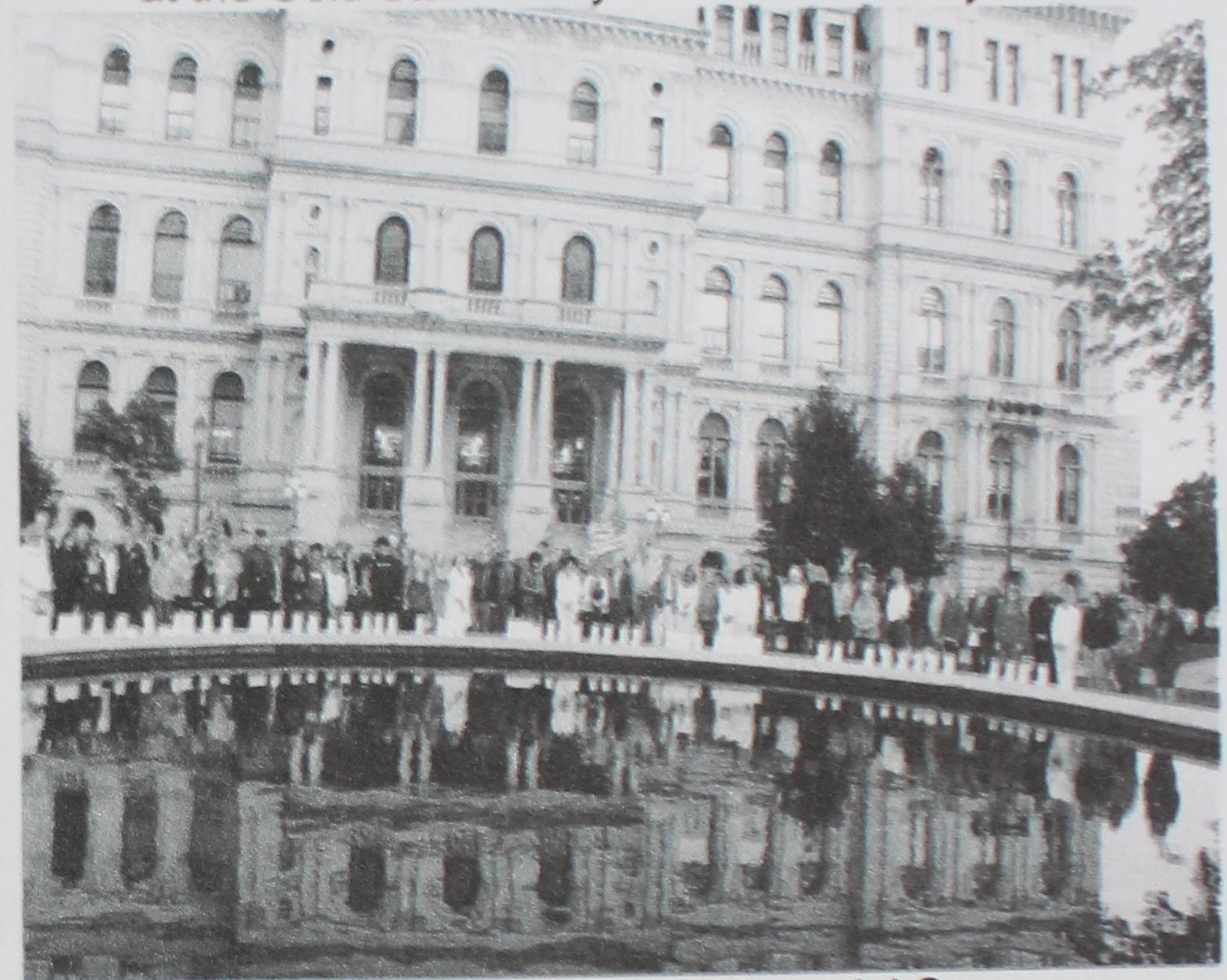
9-29-19 Gold Star Mothers' Memorial Ceremony Attendees with luminary bags for the occasion