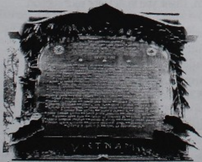
God Bless America!

Many made the supreme sacrifice for the following....."FREEDOM-never take it for granted; because, it's NEVER free".